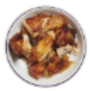
BBQ Chicken Half